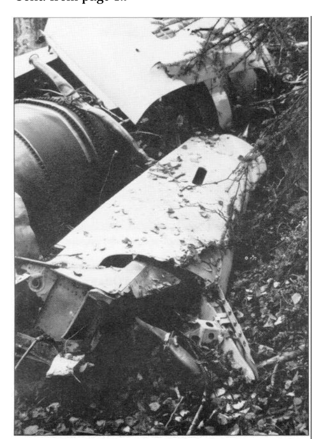
Birds and Bedlam Cont. from page 12